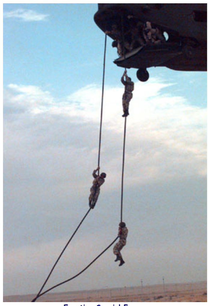
Egyptian Special Forces

Student Workbook Supplementary Listening Audio CD