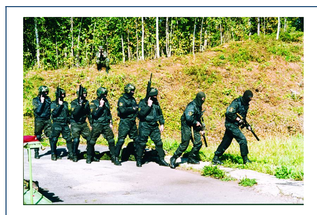
Russian Special Forces Soldiers in Training